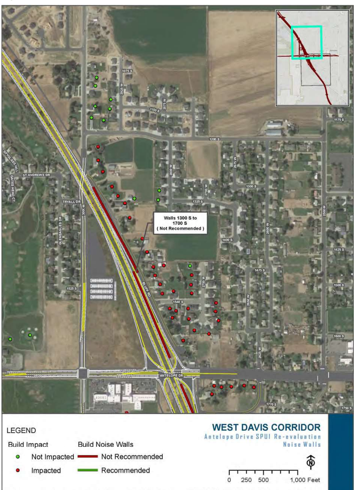
Figure 5. Build Scenario Noise Walls [1 of 2]