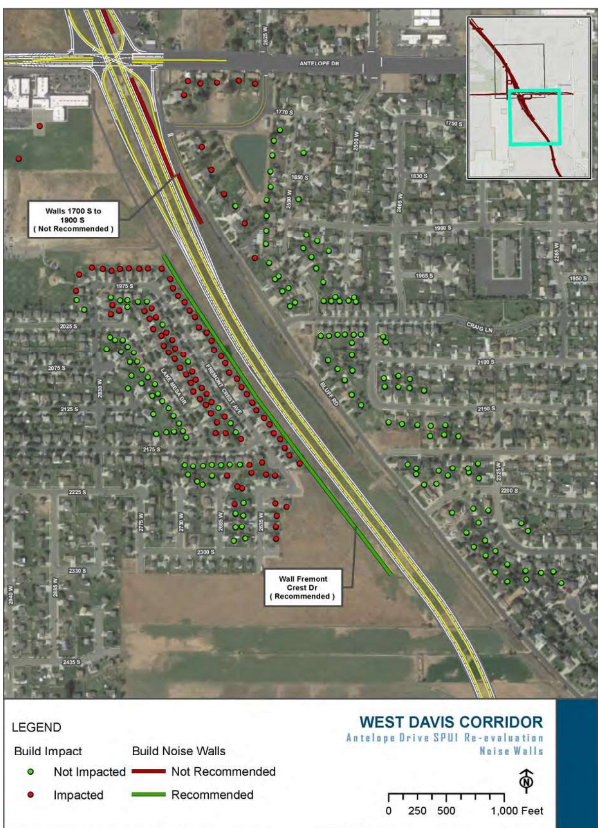
Figure 6. Build Scenario Noise Walls [2 of 2]