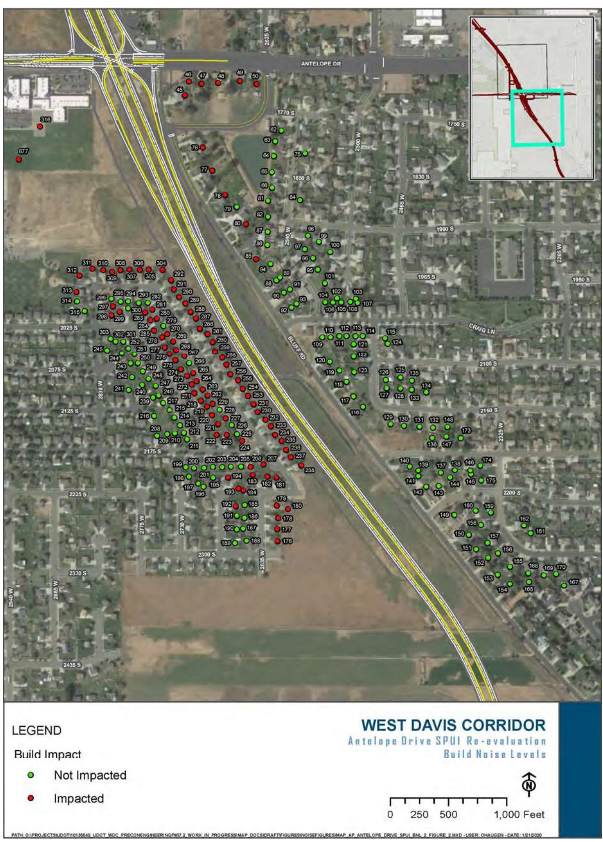
Figure 4. Build Scenario Noise Receptor Map [2 of 2]