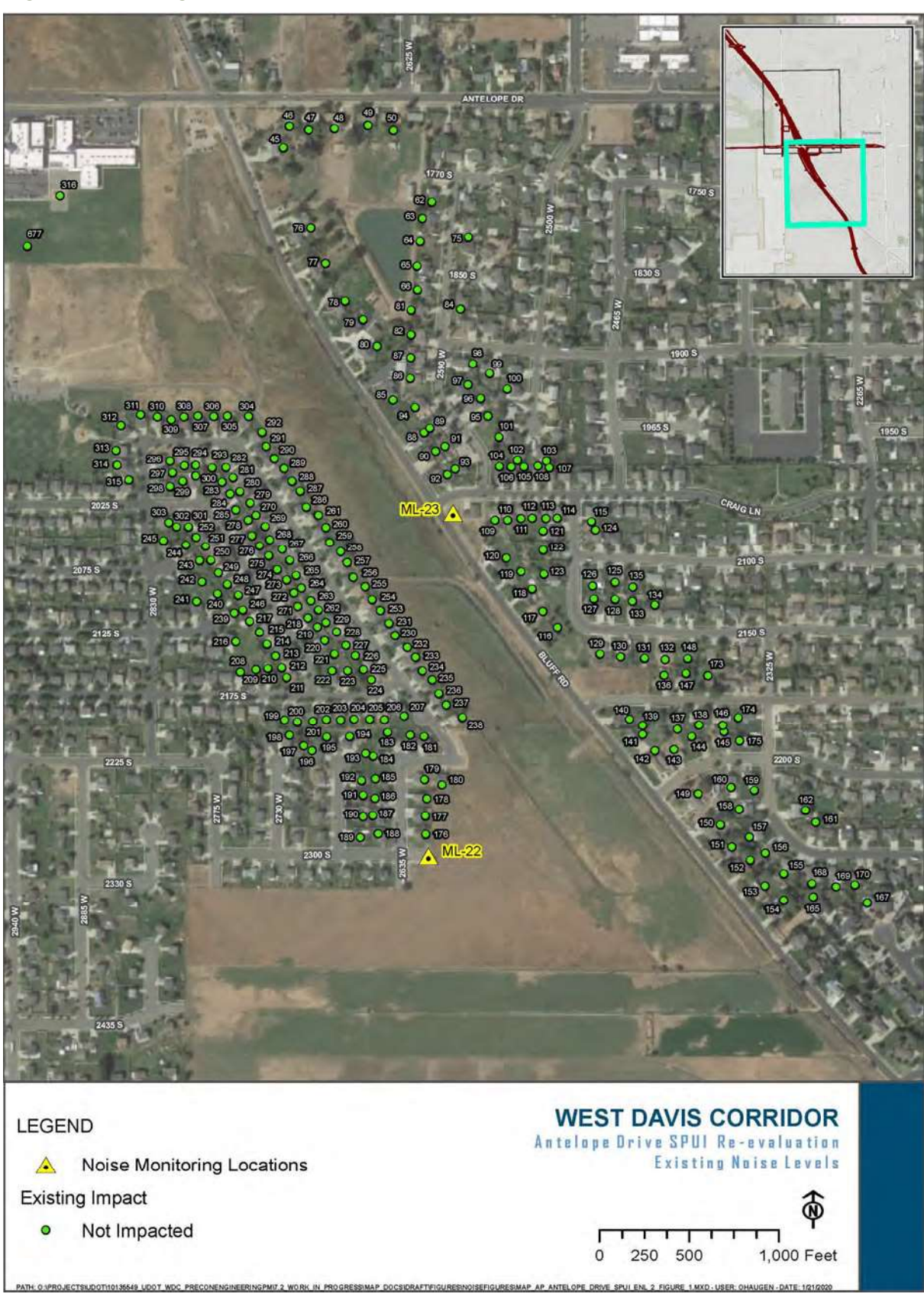
Figure 2. Existing Noise Receptor Map [2 of 2]