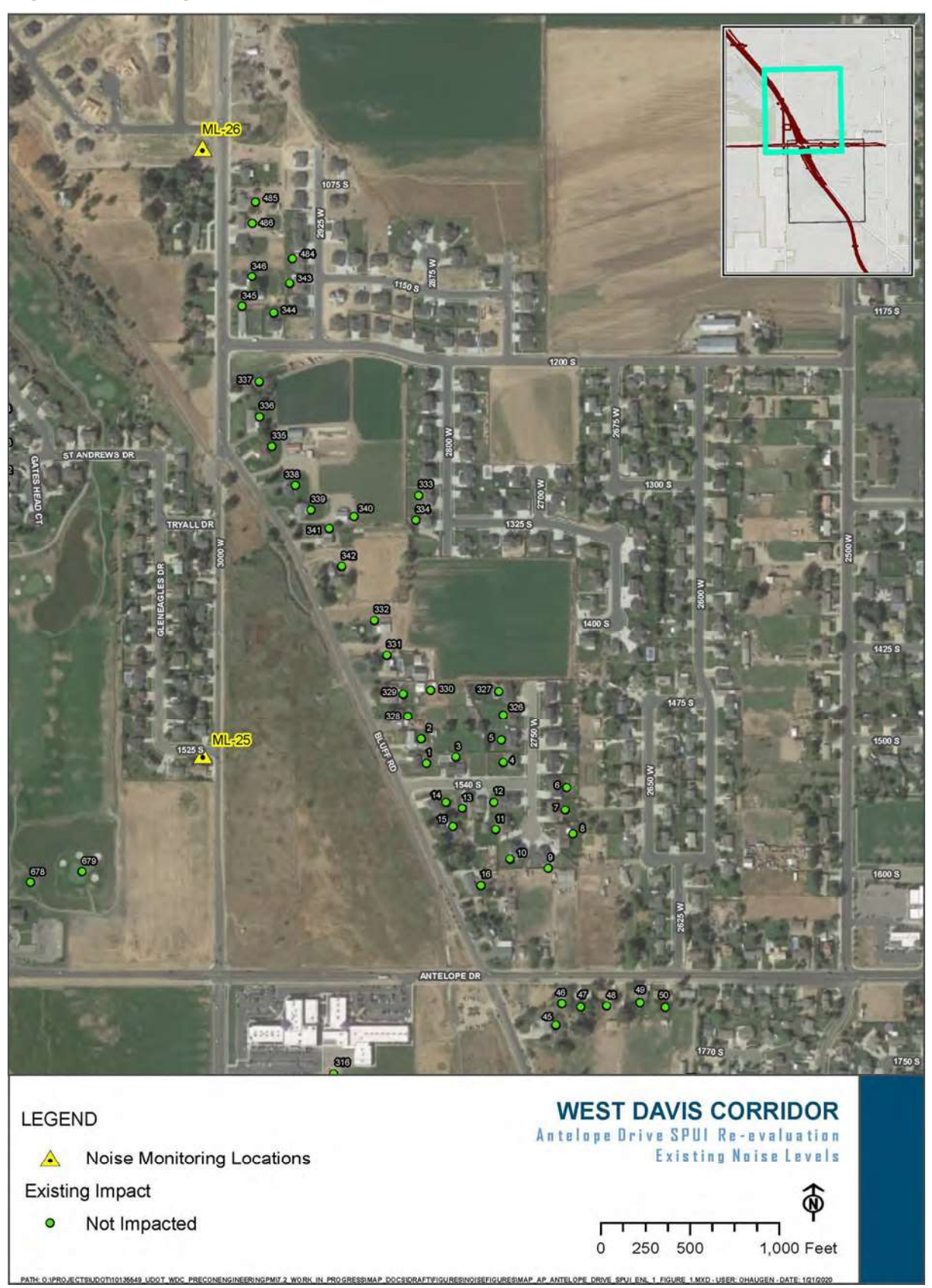
Figure 1. Existing Noise Receptor Map [1 of 2]